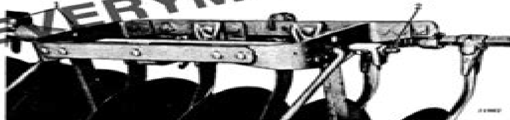
Figure 14—Tension Spring, Leveling Bar, and Set Screw