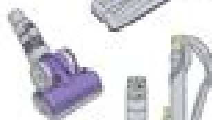
Copyright © 2004 Wiley Periodicals, Inc.