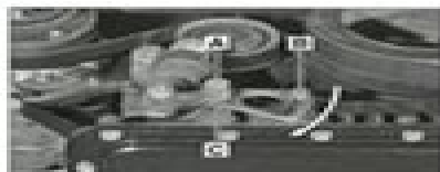
Adjust A/C belt tension. 020 Maintenance