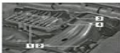
Locations of hundreds of electrical components: Fuse panel under passenger seat. ECL Electrical Component Locations