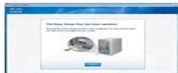
Easy Setup Key Has Been Updated