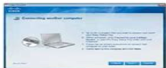
Connecting Another Computer