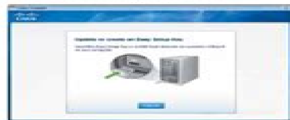
Update or Create an Easy Setup Key