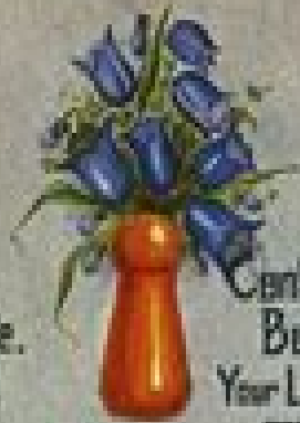
Canterbury Bell. Your Letter received.