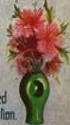
Red Carnation. My heart aches for you.