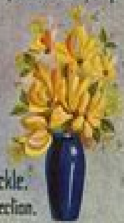
Monardella. Devoted Affection.