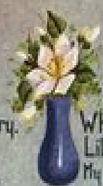
White Lily. My love is pure.