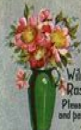
Wild Rose. Pleasure and pain.