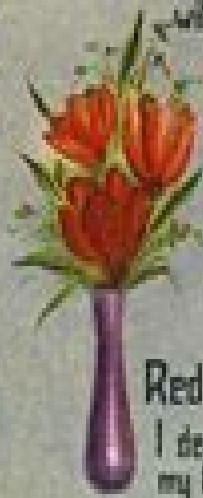
Red Tulip. I declare my love.