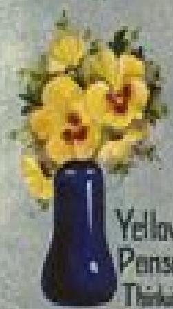
Yellow Pansy. Thinking of you.