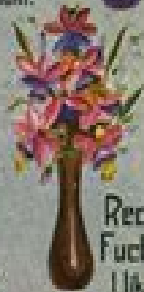
Red Fuchsia. I like your taste.