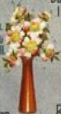
Apple Blossom. I prefer you before all.