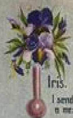
Iris. I send a message.