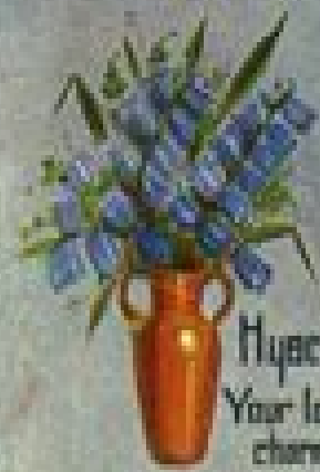
Hyacinth. Your loveliness charms me.