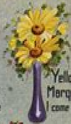
Yellow Marigold. I come soon.