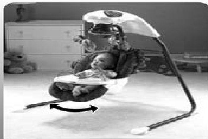
Cradle (Seat moves side to side)