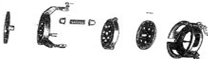
Fig. 86. - Clutch, exploded view.