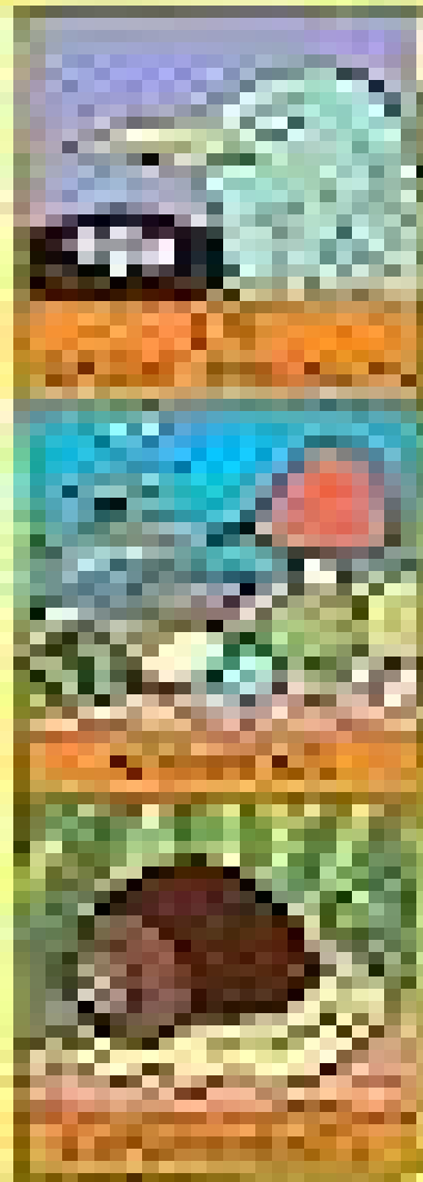
ILLUSTRATION BY JIMMY