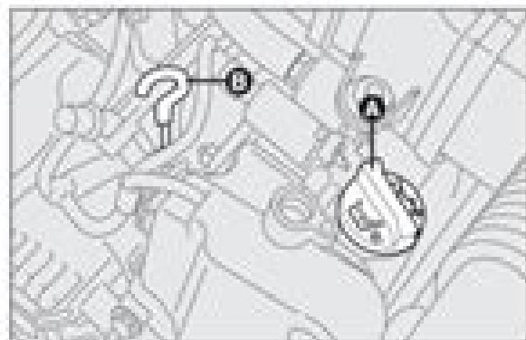
fig. 204 – 1.2 and 1.4 s versions

The oil level should never exceed the MAX line.