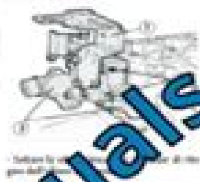
Sistemi di lubrificazione

Il sistema a olio è costituito da vari componenti: un filtro olio, un indicatore di livello olio e un sensore di livello olio.