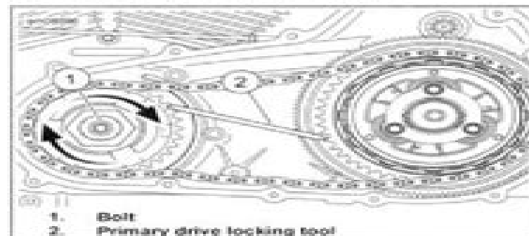
Figure 5-19. Installing Engine Compensating Sprocket Bolt