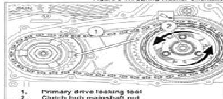
Figure 5-18. Installing Clutch Hub Mainshaft Nut