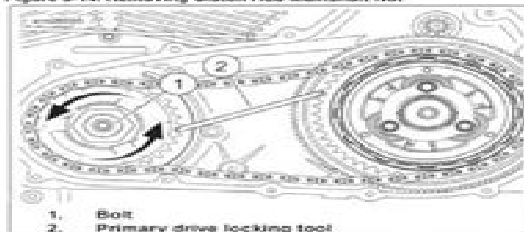
Figure 5-14. Removing Clutch Hub Mainshaft Nut