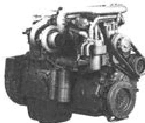
Big Cam IV

Copyright © 1999 Cummins Engine Company, Inc.