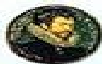
Anthony van Dyck (1633–1691)