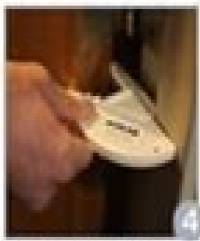
4 Open doors, place wet floor signs.