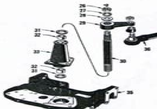
Fig. MF9 — Exploded view of the upper pedestal and components used on model MF45 with manual steering.

Remove the nut (26—Fig. MF9) retaining steering arm (29) to pedestal shaft and remove the steering arm. Remove pedestal shaft (30), examine all parts and renew any which are damaged or show wear. Ream new bushings (32), after installation, to an inside diameter of 1.5005-1.5015. Pedestal shaft (30) should have a clearance of 0.0005-0.002 in the bushings.