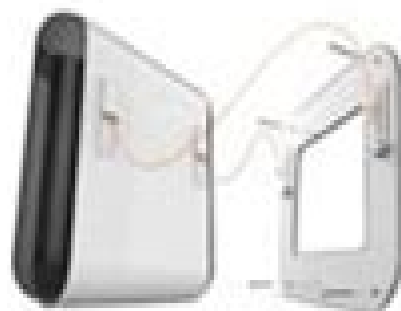
Fig. 6 Exploded view of a mechanical assembly (3D CAD model) showing the assembly sequence. The components are arranged in a way that shows the order in which they should be assembled.

The exploded view is usually an isometric view assembly with all its components exploded apart. The main difference is that the explosion is controlled along one or more of the Cartesian axes depending on how the problem comes together or apart. The main strength of a standard exploded view suggests that a specific sequence or set of stages is required to disassemble it. Such a time-based sequence often involves understanding the flow between a root that holds the main assembly in place or a place where the major components are. Once these points are removed there is generally a series of nested parts mechanically fastened together. The designer of most products understands the reality that every component in an assembly is the least order that it goes together and comes apart. The image of Figure 3(3D) shows assembly (Fig. 3) in a way to guide. With the advent of computer-aided design the process of exploding complex assemblies is easier than ever, and the view can be constructed so that showing they can understand photographs (renderings with color) to help differentiate the various parts. Nevertheless, a designer has to be able to draw an exploded view early in the process (Fig. 5) or use variations of the stronger is and things easy to read (hidden features rendering (Fig. 6)