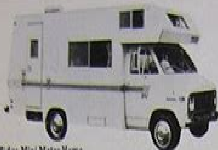
Midas Mini Motor Home