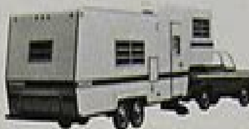
Midas Fifth Wheel