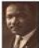
Martin Luther King Jr.