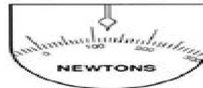
Weight on the moon