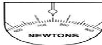
Weight on earth