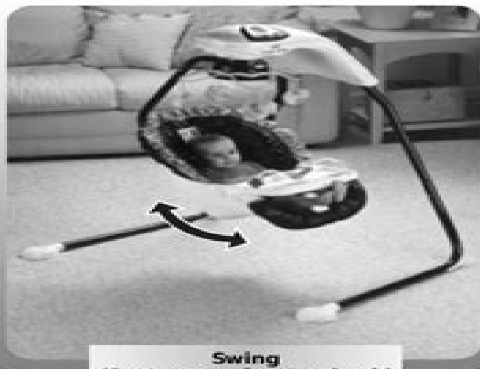
Swing (Seat moves front to back)