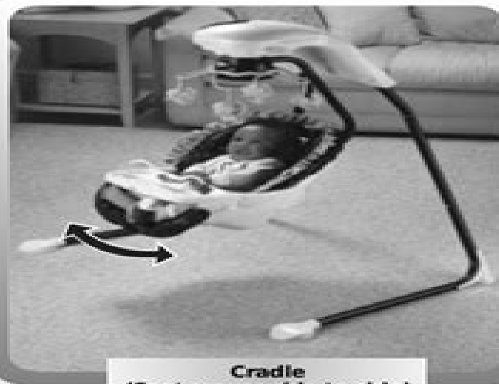
Cradle (Seat moves side to side)